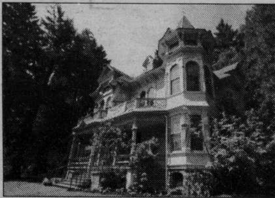
The Shelton-McMurphey-Johnson house is nestled in a forest park of Skinner Butte and overlooks the Eugene train station.

SMJ Associates raise funds to restore the house in addition to recruit-