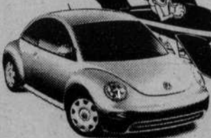
'01 VW BEETLE #W20302, #W21032

The Beetle, Jetta or Golf, all Equipped with 5 Speed, AM/FM/Cassette, A/C, Security System, Keyless Entry and More!