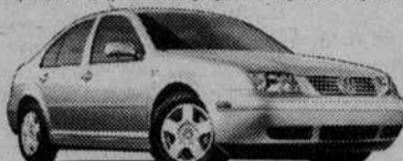
'01 VW JETTA #W2T20356