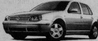
'01 VW GOLF #W21065, W21058, W21060