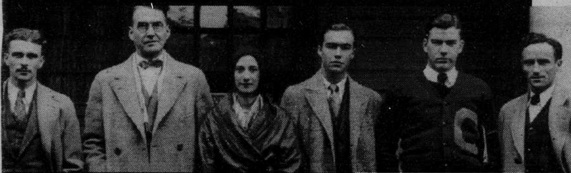
The original Bookstore Co-op Board members in 1920

Open to all current UO students, faculty and staff members