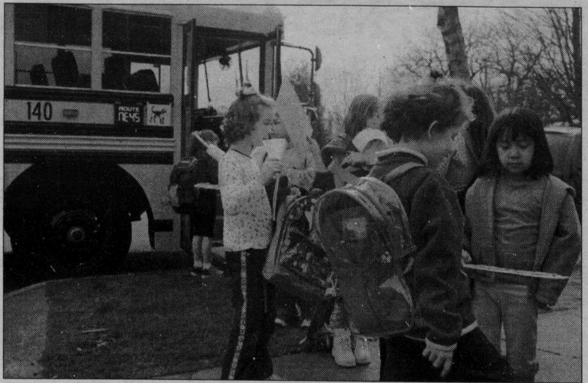
Several hundred local elementary school children must now be relocated after their schools were slated for closure March 21.