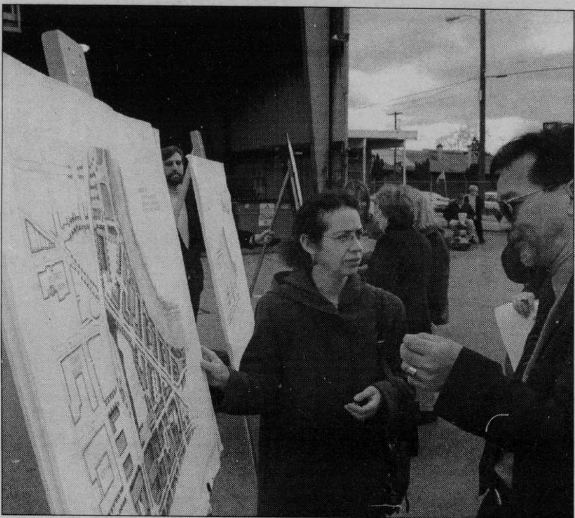
Plans for a new federal courthouse in Eugene were unveiled last week. The new courthouse is forcing AutoCraft Body and Paint to move, which in turn may require the University to relocate garbage collection services, recycling operations and storage facilities.