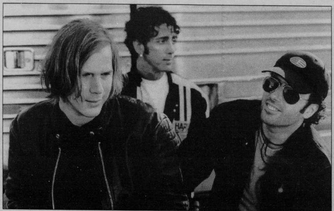
The Jeff Healey Band will play in the Sheldon High School Auditorium for their CD release party on Sunday. Tickets are $21.

9:30 p.m. — Open Mic Night (pick-up jam). Black Forest Tavern, 2657 Willamette St. Free.