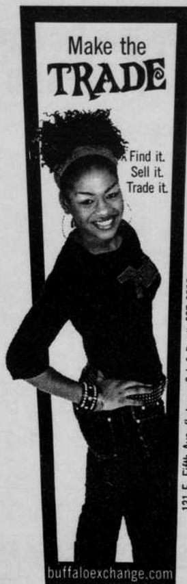
131 E. Fifth Ave. (between Oak & Pearl) 687-2805

13th & Lawrence • Eugene • 683-1300 www.bergsskishop.com