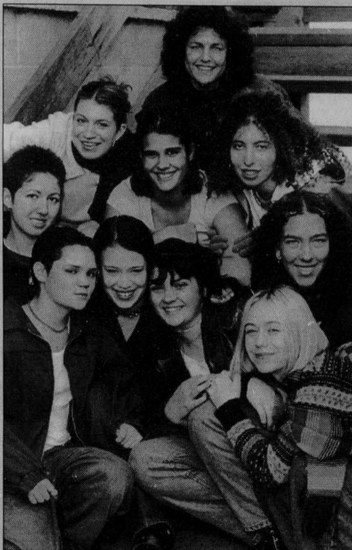
The Young Women's Theatre Collective, an experimental theater company, will present a new show called 'Lumina' on Friday and Saturday at WOW Hall.