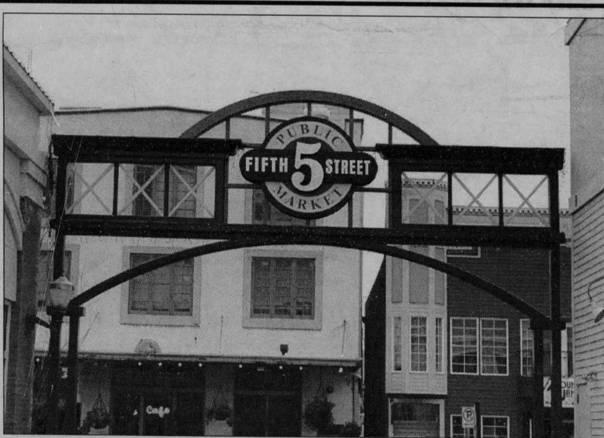
A city landmark in the heart of downtown, the Fifth Street Public Market is but one of the many attractions visitors find unique about Eugene.