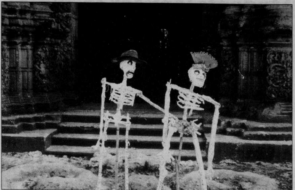
'Despues de la Boda' is part of the Maude Kerns Art Center's Day of the Dead exhibit, a celebration to honor ancestral spirits of the Mexican people.