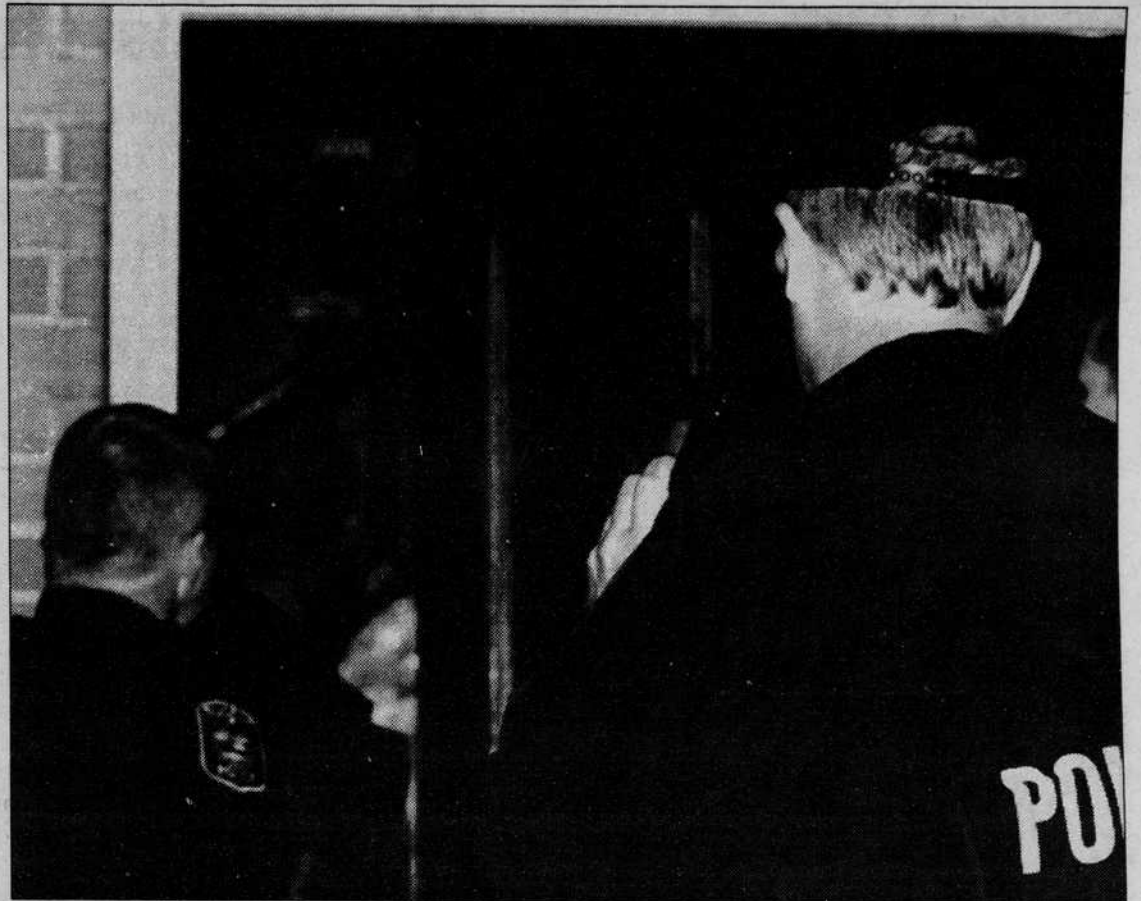
Party Patrol officers of the Eugene Police Department respond to a call of a noise disturbance at a fraternity house Oct. 20.