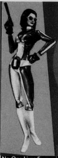
No One Lives Forever's heroine Cate Archer.

First person shooter (FPS) fans may have been feeling neglected of late, as role-playing games (RPGs) like Diablo 2 and Icewind Dale