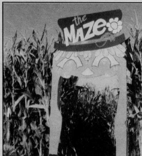
The MAiZE is made of silage corn, which grows much faster and taller than most types of corn — so tall that visitors cannot see over it.

Lone Pine Farms expects people to get lost — in its corn maze, that is