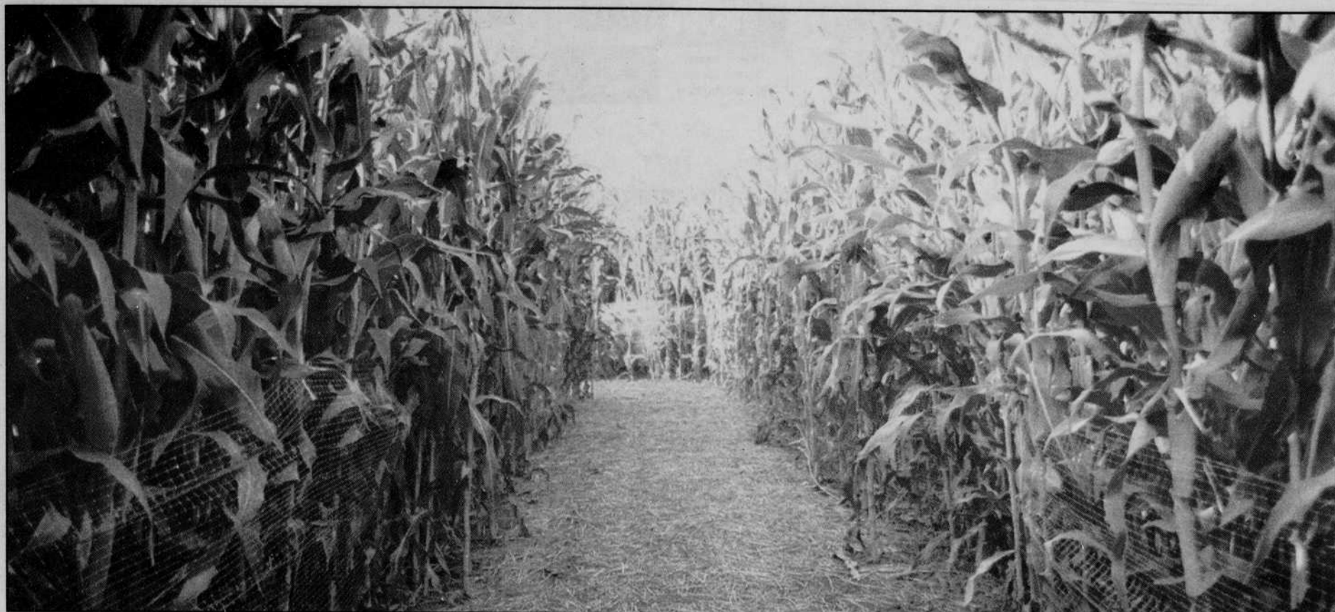
Catharine Kendall Emerald

The MAiZE, located outside of Eugene, is one of 61 corn mazes in the United States. It occupies 10 acres of land at Lone Pine Farms. Beginning Oct. 13, The MAiZE will begin holding 'haunted' evenings.