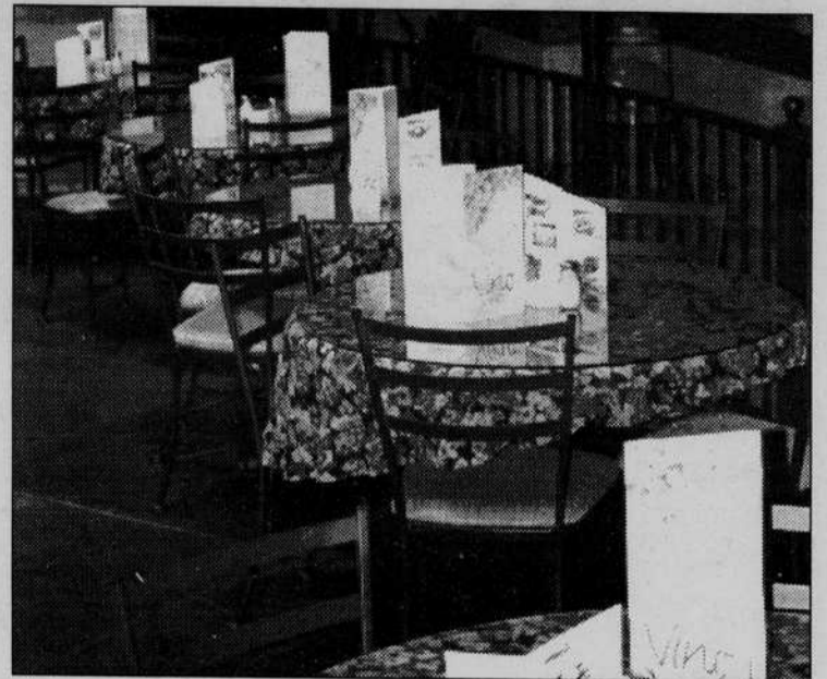
Kevin Calame Emerald

Now, if your goal is to spend no more than $20 for dinner, you may have to settle for water with your