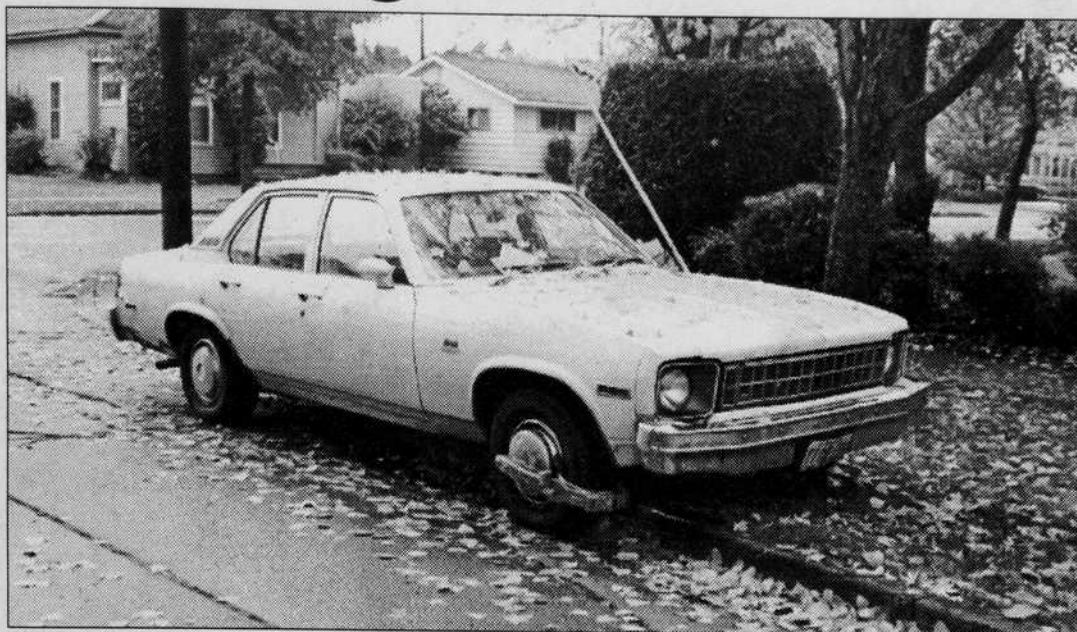
This is an example of a poor parking decision. To avoid the boot, stay off the sidewalk and pay your parking fines.

The earlier students get in their applications and requests for overnight parking, the more likely they are to receive approval. Those who are not approved will be put