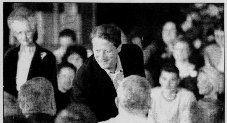
Al Gore, shown here in Portland in mid-May, will attempt to excite the Los Angeles crowds.