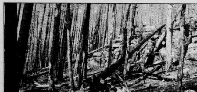
Inge Scheve for the Emerald

The burned-out trails mean- Turn to Waldo Lake , page 4