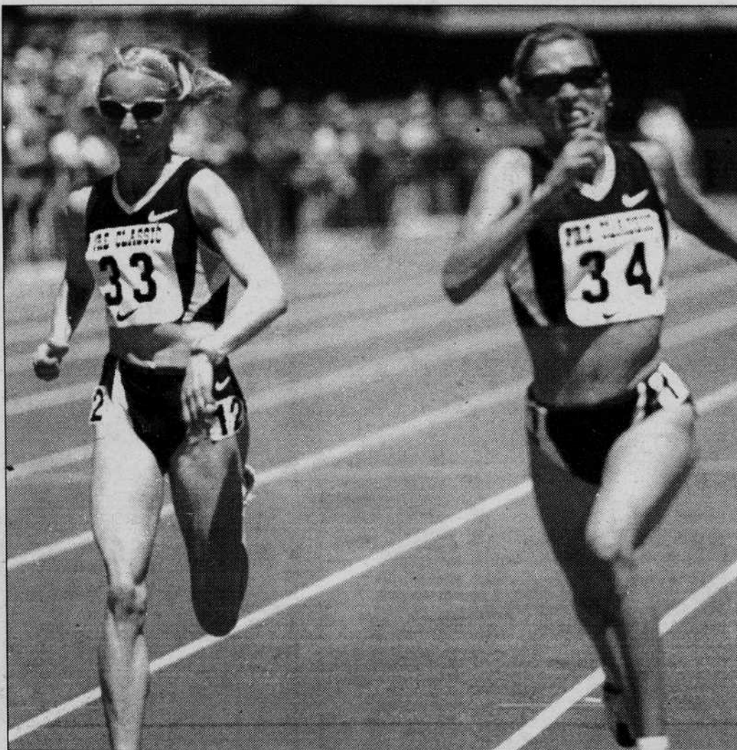
Gabriela Szabo edged out Suzu Favor Hamilton in the most thrilling race of the day. Szabo's surge near the end of the 1,500 meters was just enough to overcome Favor Hamilton, who collapsed at the race's conclusion.

Although no records were set, fans were treated to an exciting 800 meters race. Local favorite Maria Mutola's streak of nine straight Prefontaine titles in the half mile was in danger for about 300 meters, but the Mozambique native out-kicked Olympian Regina Jacobs over the last 70