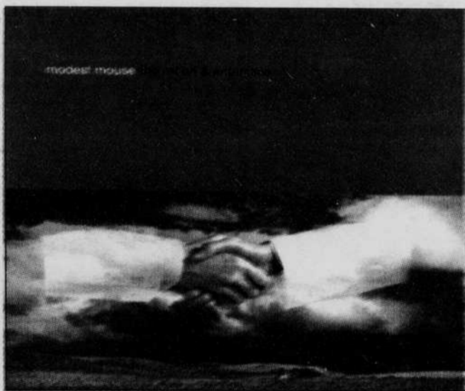
Modest Mouse, which has released other albums prior to the major label debut of 'The Moon and Antarctica,' is known for its instrumental soundscapes.