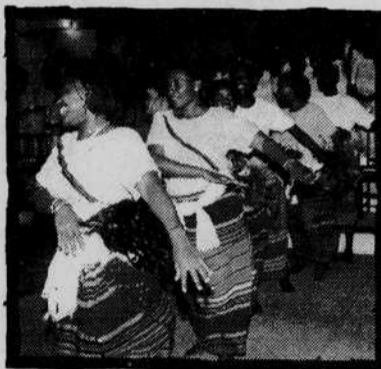
Out of the heart of East Africa comes Christ the King Church Choir , until recently one of Uganda's hidden treasures. Using percussion, dancing, and expert choral singing, the group's 40 voices weave a fabric of daily and spiritual life in East Africa.