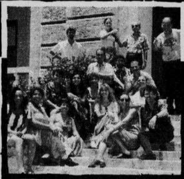
Opening a rare window into the musical soul of Cuba, the singers of Entrevoques will perform contemporary work by Cuban and Latin American composers, a little Monteverdi, a few spirituals, and a lot of tropical, breezy sounds.