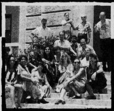
Opening a rare window into the musical soul of Cuba, the singers of Entre Voces will perform contemporary work by Cuban and Latin American composers, a little Monteverdi, a few spirituals, and a lot of tropical, breezy sounds!

The International Voices project is made possible in part by grants from the Association of Performing Arts Presenters Arts Partners Program, which is underwritten by the Wallace-Reader's Digest Funds and Doris Duke Charitable Foundation, and the Hult Endowment of the Arts Foundation of Western Oregon.