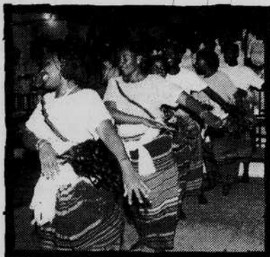
Out of the heart of East Africa comes Christ the King Church Choir , until recently one of Uganda's hidden treasures. Using percussion, dancing, and expert choral singing, the group's 40 voices weave a fabric of daily and spiritual life in East Africa.