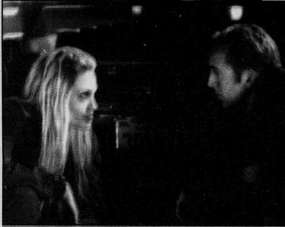
Nicholas Cage and Angelina Jolie in 'Gone in 60 Seconds'