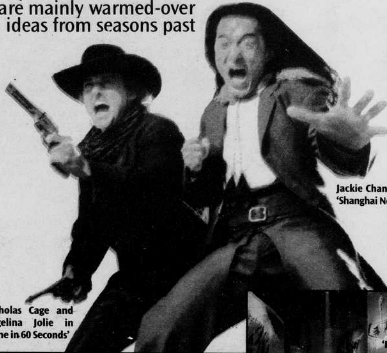
Jackie Chan stars in 'Shanghai Noon'

Titan A.E. (June 16) Voices of Matt Damon, Bill Pullman, Drew Barrymore A 19-year-old searches for a map left behind by his father that holds the secret to