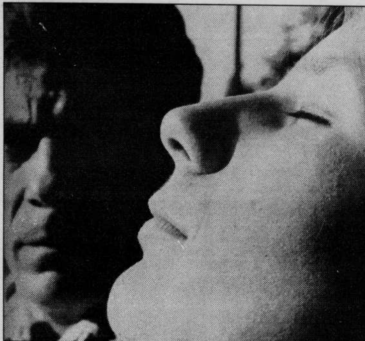
(Chris Marker's 1962 film "La Jetée," which was the inspiration for the 1995 film "12 Monkeys," will be shown at 8 p.m. Wednesday in Room 180 PLC.)