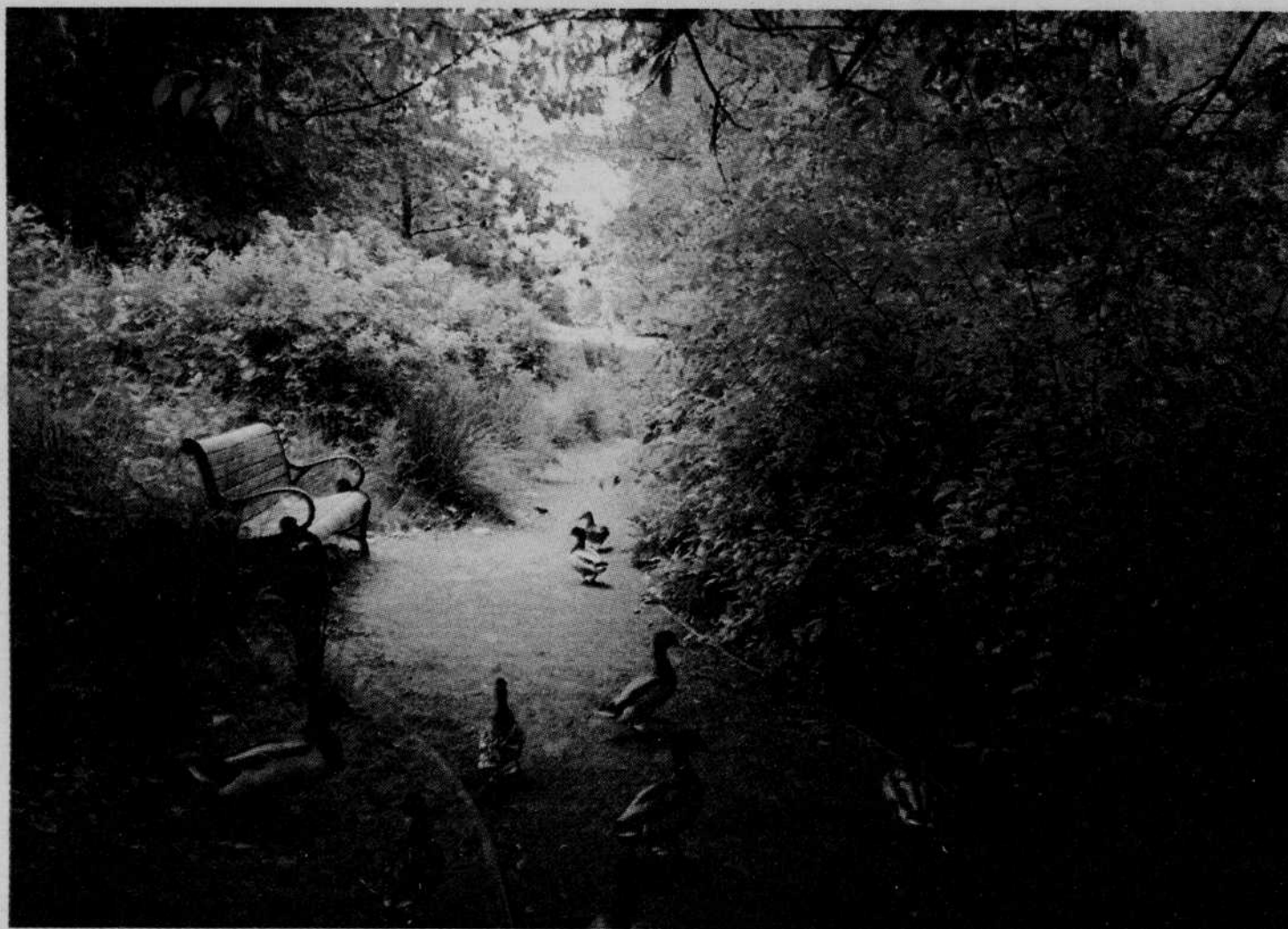
Ducks congregate among the lush vegetation surrounding the Millrace, providing a picturesque scene for an afternoon stroll. This section of the Millrace is located on Franklin Boulevard and Onyx Ave., near the Millrace Studios. Students often take breaks from classes here to enjoy the serene setting and watch the wildlife.