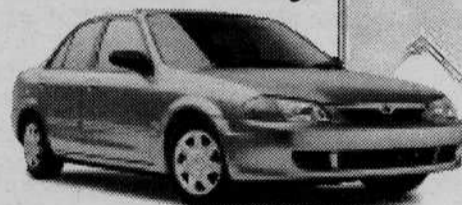
2000 Mazda Protegé

With Purchase of any new 1999 or 2000 Mazda vehicle