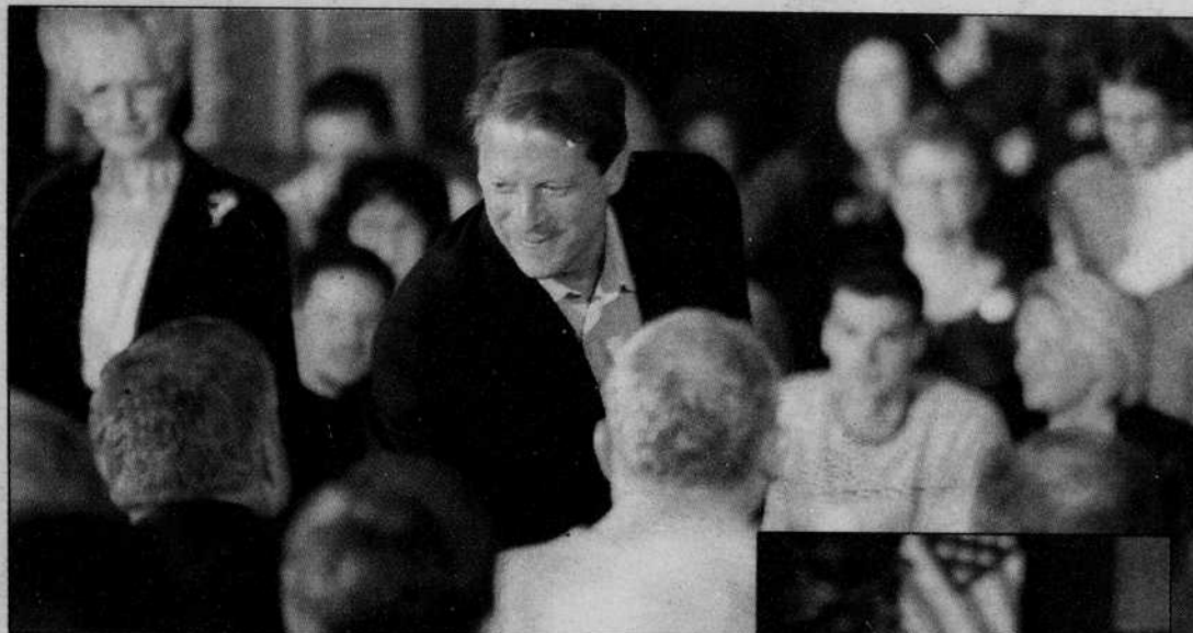
Vice President Al Gore greets attendants at his talk on Social Security on Friday during his trip to Portland.

"Our deepest obligation to one another is a commitment to make sure that no one is forced to live in poverty after a lifetime of hard work," Gore said. "No one should be faced with financial ruin because of a serious disability. No one should be faced