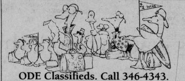
ODE Classifieds. Call 346-4343.