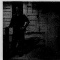
Patti Smith's father is pictured on the cover of her new CD Gung Ho .

For links to Patti Smith and Lou Reed fan clubs, label affiliations, chat groups, music reviews and more, log on to www.steamtunnels.net