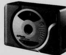
Agfa ePhoto Smile

Even the best of these ultra-low-cost cameras takes noticeably pixilated photos. (Not "grainy" photos; grain is a property of film.) If super-sharp reality capture is your aim, cheap digital photography may disappoint. But if you're experimenting with digital art, or just want casual snapshots, the under-$100 digital cameras are for you.