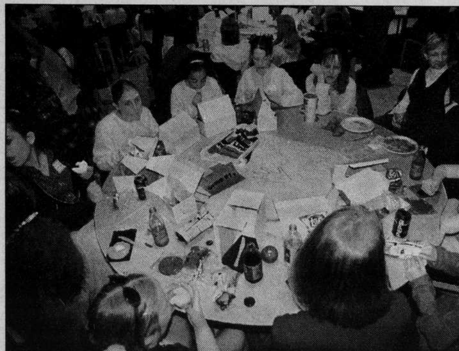
Participants in "Take Our Daughters To Work Day" have lunch in the EMU Thursday.