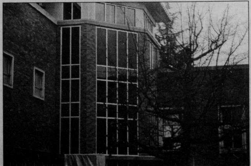
Azle Malinao-Alvarez Emerald

The construction of the new EMU elevator is near completion. The elevator will provide access to people with mobility impairments. It will be ready for use as early as Feb. 22.