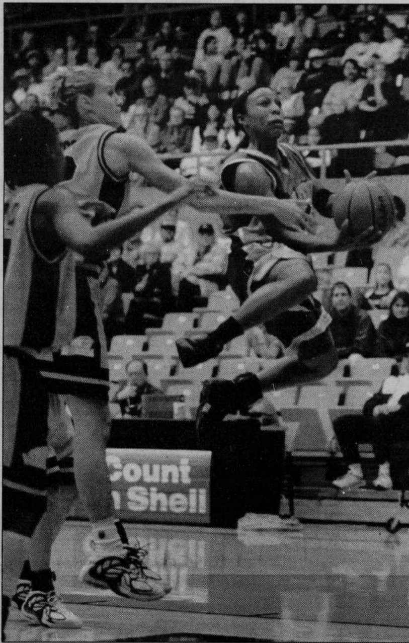
Shaq and teammates rev it up against both Arizona schools at the Pit this weekend.