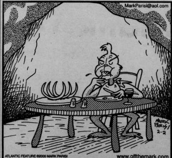
ATLANTIC FEATURE ©2000 MARK PARISI