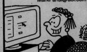
CLICKING A LINK BEFORE THE PAGE FULLY LOADS AND KNOCKS IT LOWER