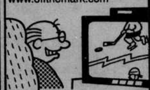
SEEING GLIMPSES OF A SCRAMBLED CHANNEL A FEW SECONDS AT A TIME