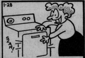
ADDING SOMETHING TO THE DRYER WITHOUT HAVING IT SHUT OFF