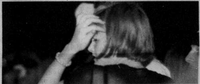
Ravers at the WOW Hall take over the dance floor, doing their thing, last Thursday night.