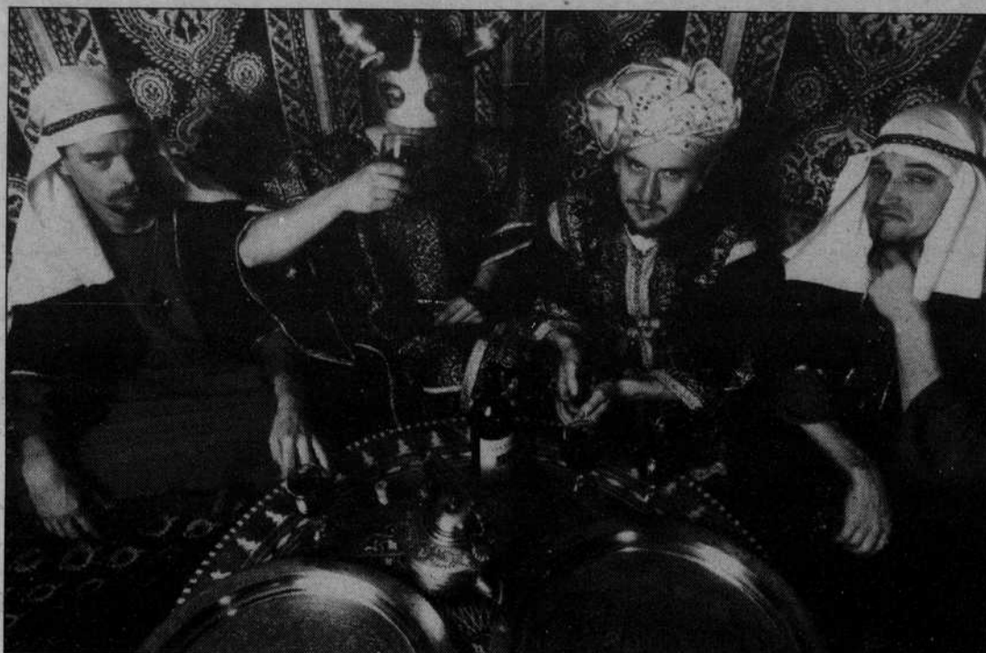
Critters Buggin' (above) and Habaneros bring some acid jazz sounds to the WOW Hall, Monday Nov. 15.

Roosters Blues Jam (blues and R&B) — Wild Duck Music Hall; 9 p.m.; $2. Techno Night (dance) — John Henry's; 10 p.m.; women free, men $2. Critters Buggin', Habaneros (acid