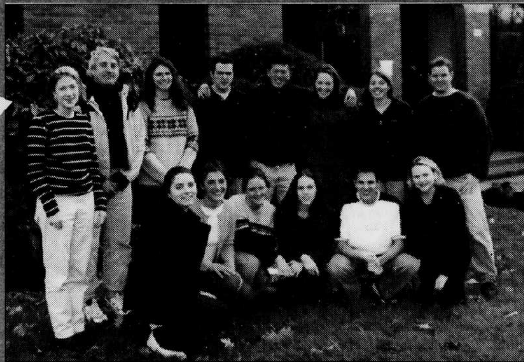
Winter 1999 Peer Health Educators!

Use your knowledge and skills to make a difference in the lives of other college students.