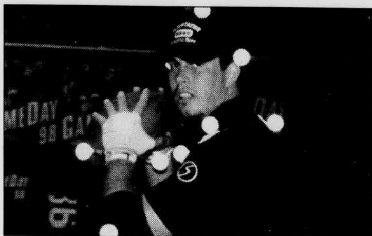
Former Washington State University and current San Diego Charger quarterback Ryan Leaf poses for NCAA Gamebreaker '99's creators to capture his throwing motions.

But what I imagine really kept the designers busy was all the "motion capture" they did. Mo-