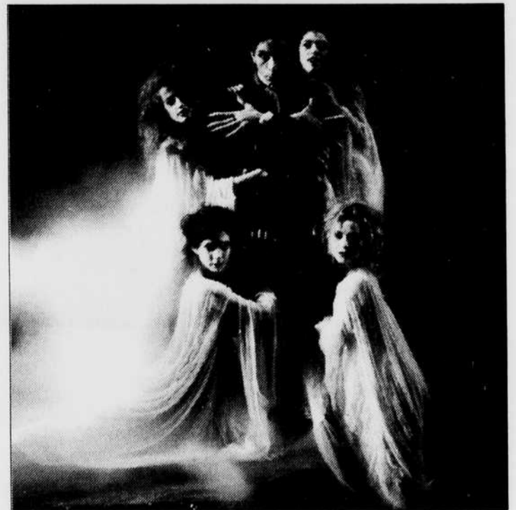
The costumes of some 'Dracula' performers in The Eugene Ballet Company's production of 'Dracula' reflect the show's time era of the World War I.