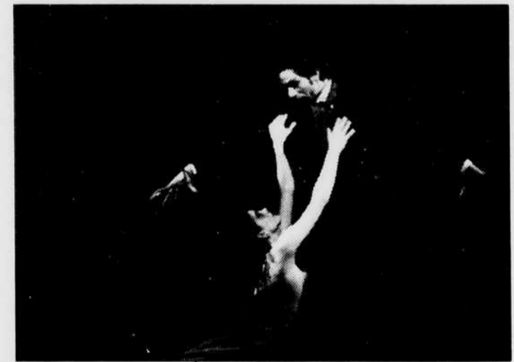
The Eugene Ballet Company's production of 'Dracula' utilizes not only ballet moves but also drama and dance theater effects to give the production a "cinematic feel."