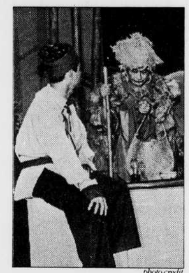
Two actors perform a scene in the upcoming Robinson Theatre attraction "Truong Ba's Soul in the Butcher's Skin."

Tickets are $5 for students and $8 for the general public. Tickets are available at the EMU ticket office or the University Theatre box office in Robinson Theatre. Call 346-4363 or 346-4191 for details.