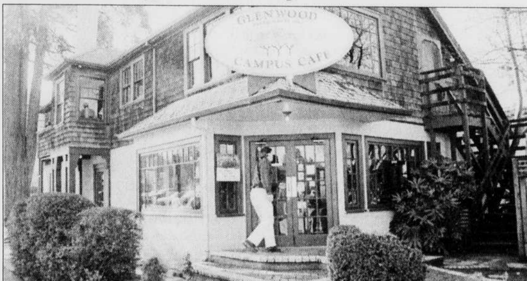
The Glenwood, 1340 Alder St., is one restaurant that stays open until the wee hours.

"The server is on a first-name basis and has gotten to know all of them," she said.