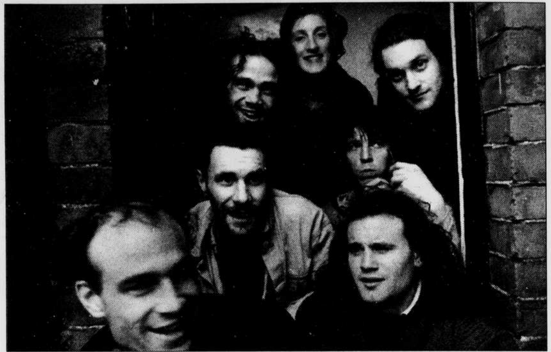
Kila, a modern Irish dance band, will perform at WOW Hall on March 15 at 8:30 p.m.