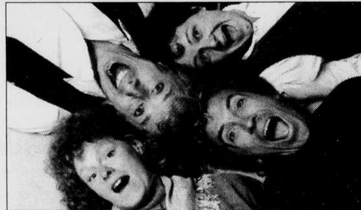
Skye will play at the seventh annual St. Patrick's Day Irish Pub Night on March 17.