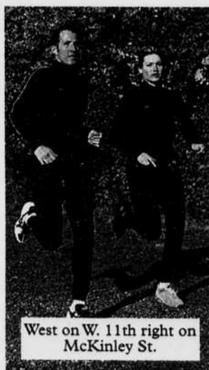
West on W. 11th right on McKinley St.

Don't miss the factory direct sale of 1998!