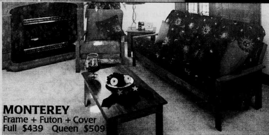
MONTEREY Frame + Futon + Cover Full $439 Queen $509