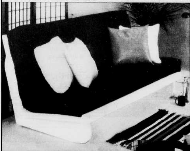
RIVIERA Frame + Futon + Cover Full $299 Queen $329

SPECIAL PACKAGE PRICES now for back to school GUARANTEED BEST PRODUCTS