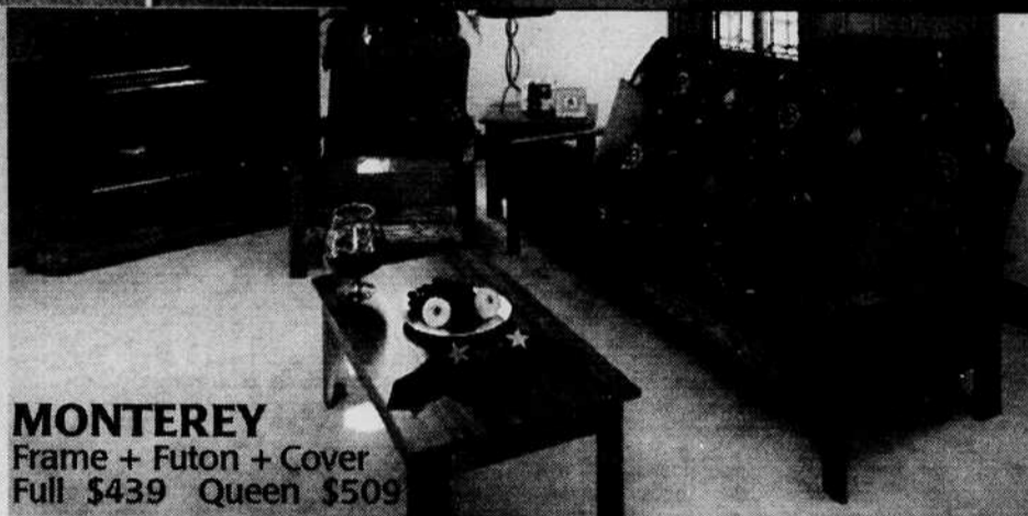
MONTEREY Frame + Futon + Cover Full $439 Queen $509