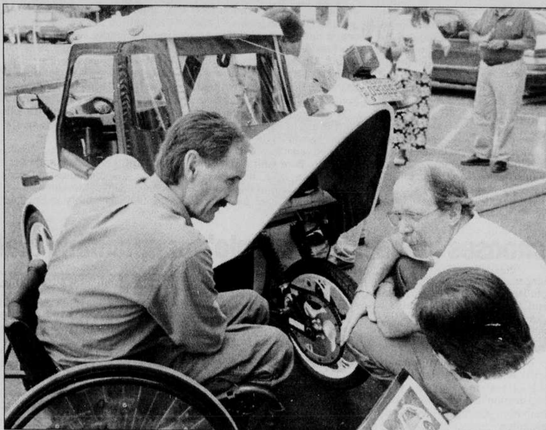
Employees of EWEB examine an electric car called "gizmo," which the company will use for meter reading.