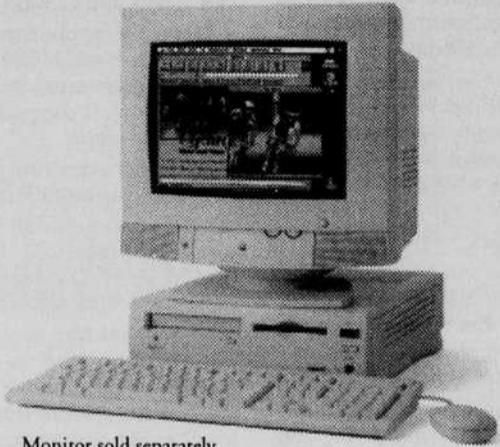
Monitor sold separately

'97 Grads - Time Is Running Out To Buy At Academic Prices!