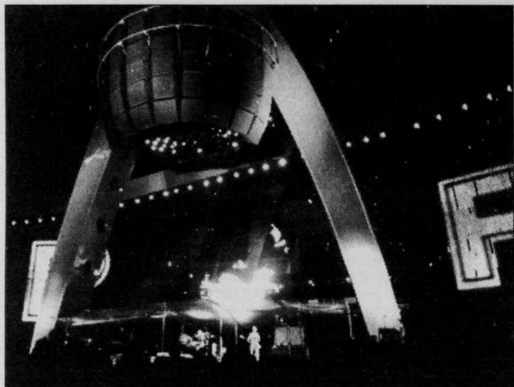
The "PopMart" set includes a 100-foot arch and a huge video screen.