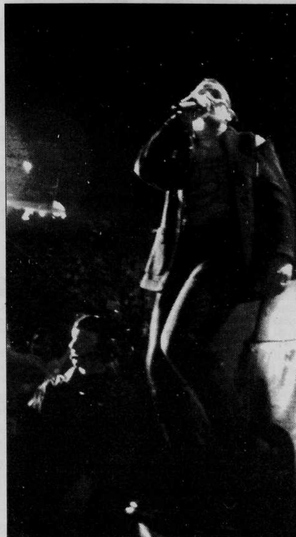
Bono sings to the crowd from center stage.