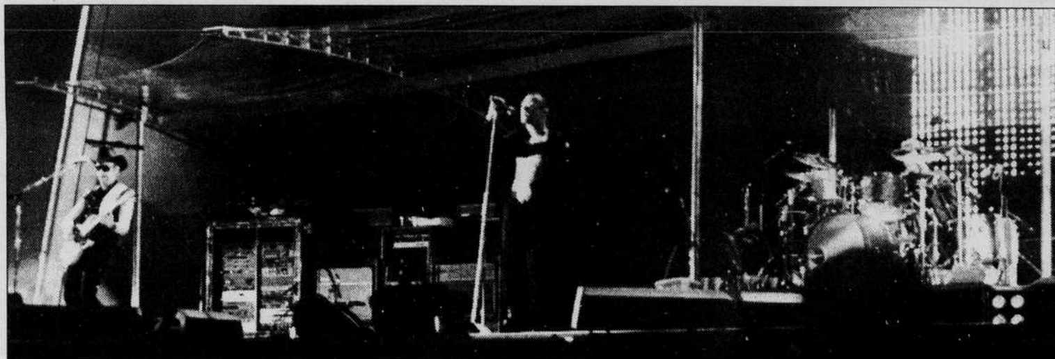
U2 was on stage for a total of two and a half hours, including encores, during their Tuesday night concert at Autzen Stadium.