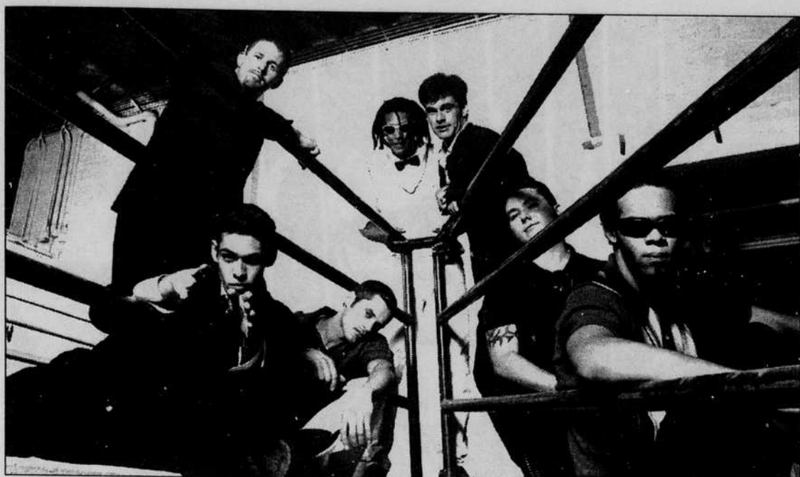
Ska band The Skeletones was formed in 1986 in Riverside, California, and has since released two albums.