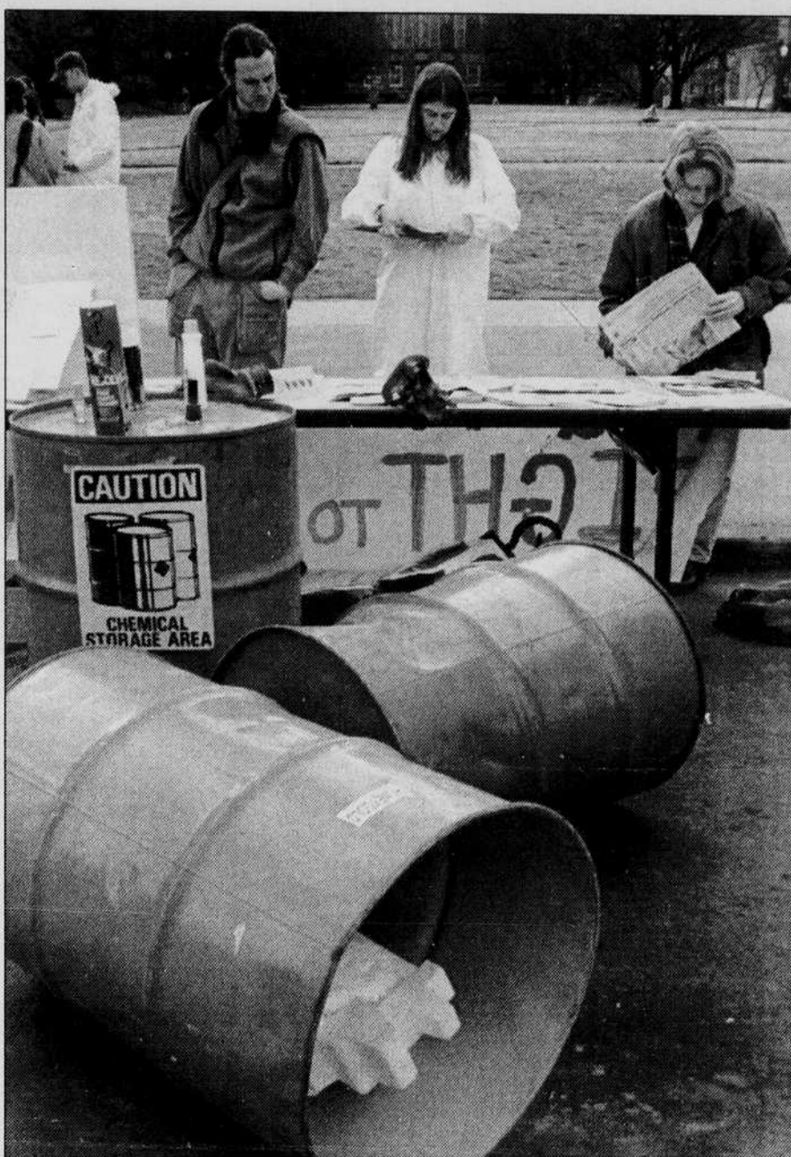
Two hundred fifty students signed "warning label" petitions at a staged toxic waste spill along 13th Avenue on Wednesday.