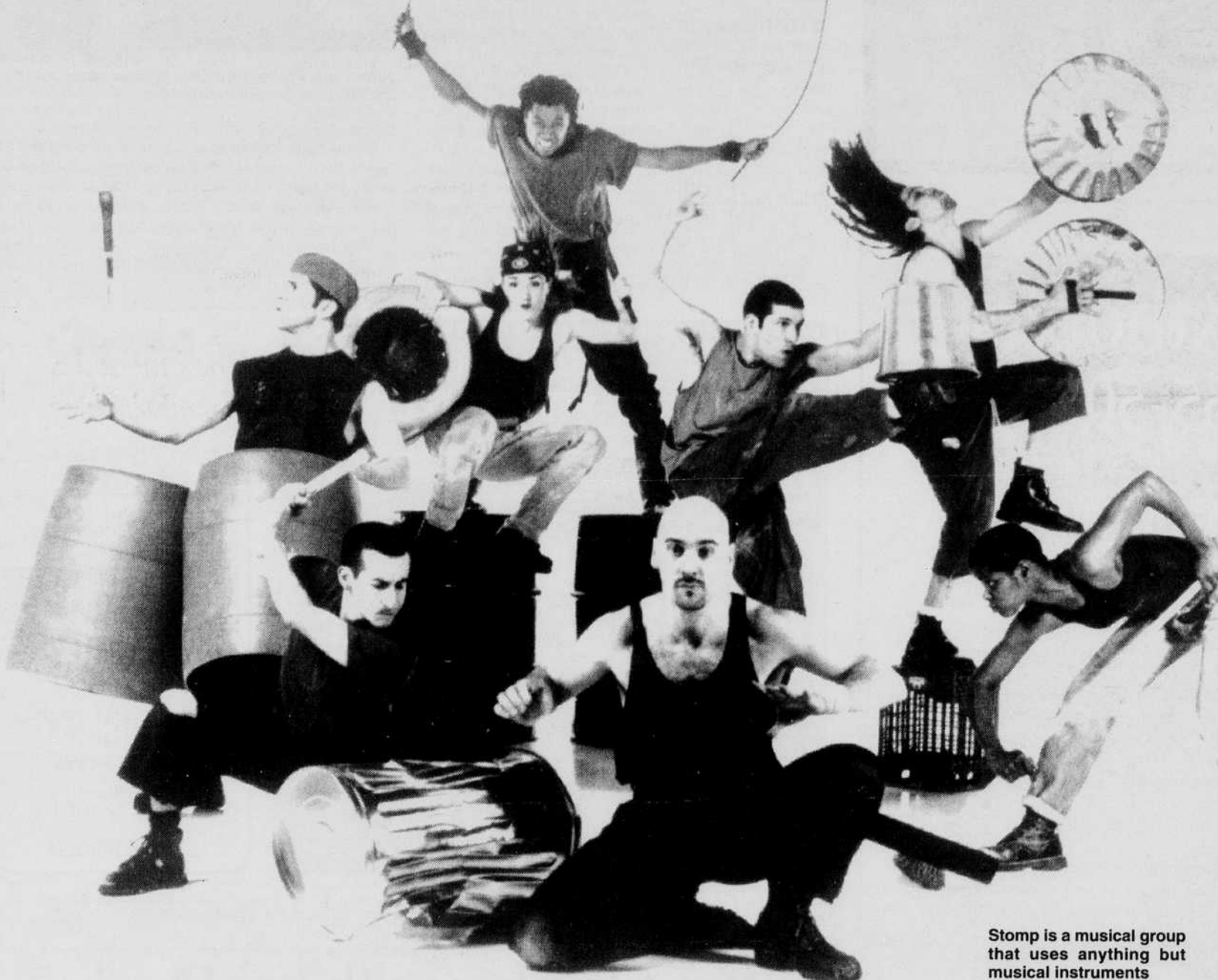
Stomp is a musical group that uses anything but musical instruments